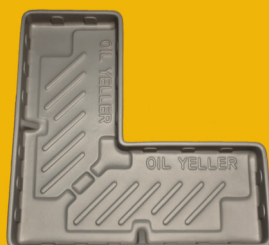
PA-005 L-SHAPED BURNER & FILTER TRAY

Required for PA-001, PA-003 and PA-009 installation when installing steel tanks with nipple legs. (Not required for fiberglass tanks)