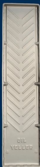
PA-002/PA-004 NARROW TRAY

DIMENSIONS (L x W x H): 72" x 14 1/2" x 2 3/4" (PA-002) 72" x 17 1/4" x 2 3/4" (PA-004)