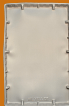
PA-009 LARGE RECTANGULAR TRAY

ANSI/UL—Std. No. 464 Audible Signal Appliance