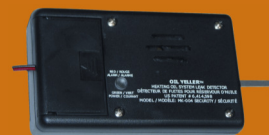
MK-003 (9V BATTERY) / MK-004 (HARD-WIRED) LEAK DETECTION ALARM

CONTAINMENT CAPACITY: 7.9 US Gal (PA-002) 12.9 US Gal (PA-004)