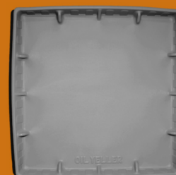
PA-010 SQUARE TRAY

DIMENSIONS (L x W x H): 35 1/4" x 35 1/4" x 3"