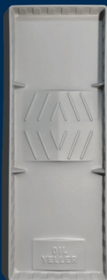
PA-001/PA-003 WIDE TRAY

DIMENSIONS (L x W x H): 72" x 27" x 5" (PA-001) 84" x 30" x 5" (PA-003)