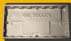
PA-008 RECTANGULAR BURNER & FILTER TRAY

DIMENSIONS (L x W x H): 24" x 13" x 2 3/4"