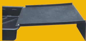
EB-004 EXTENSION BRACKET

Allows a PA-004 tray to be extended to fit beneath a standard steel 330 US Gal tank.