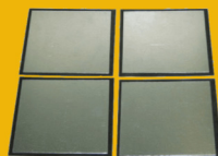
BP-002 INSTALL KIT

Allows a PA-004 tray to be extended to fit beneath a standard steel 330 US Gal tank.