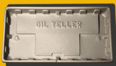
PA-008 RECTANGULAR BURNER & FILTER TRAY

DIMENSIONS (L x W x H): 24" x 13" x 2 3/4"