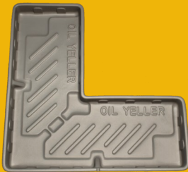
PA-005 L-SHAPED BURNER & FILTER TRAY

BP-002 required for PA-001, PA-003, PA-007, PA-009 and PA-010 installations when installing steel tanks with nipple legs. Pipe flange footings require only NG-002 gaskets. (Kits/gaskets not required for fiberglass tanks)