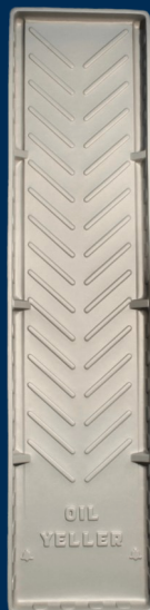
PA-002/PA-004 NARROW TRAY

DIMENSIONS (L x W x H): 72" x 14 1/2" x 2 3/4" (PA-002) 72" x 17 1/4" x 2 3/4" (PA-004)