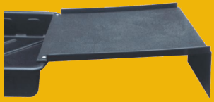
EB-004 EXTENSION BRACKET

Allows a PA-004 tray to be extended to fit beneath a standard steel 330 US Gal tank.