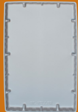
PA-009 LARGE RECTANGULAR TRAY

ANSI/UL—Std. No. 464 Audible Signal Appliance