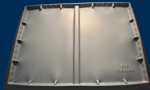
PA-007 HORIZONTAL TANK TRAY

CONTAINMENT CAPACITY: 41.5 US Gal (PA-001) 51.5 US Gal (PA-003)