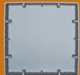
PA-010 SQUARE TRAY

DIMENSIONS (L x W x H): 35 1/4" x 35 1/4" x 3"