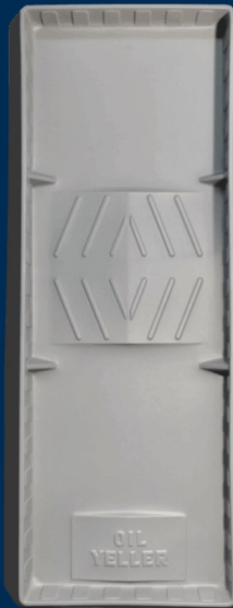
PA-001/PA-003 WIDE TRAY

DIMENSIONS (L x W x H): 72" x 27" x 5" (PA-001) 84" x 30" x 5" (PA-003)