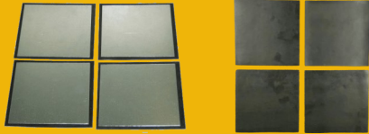
BP-002 INSTALL KITS & NG-002 GASKETS

Allows a PA-004 tray to be extended to fit beneath a standard steel 330 US Gal tank.