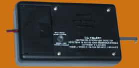
A-003 (9V BATTERY) / A-004 (HARD-WIRED) LEAK DETECTION ALARM

CONTAINMENT CAPACITY: 7.9 US Gal (PA-002) 12.9 US Gal (PA-004)